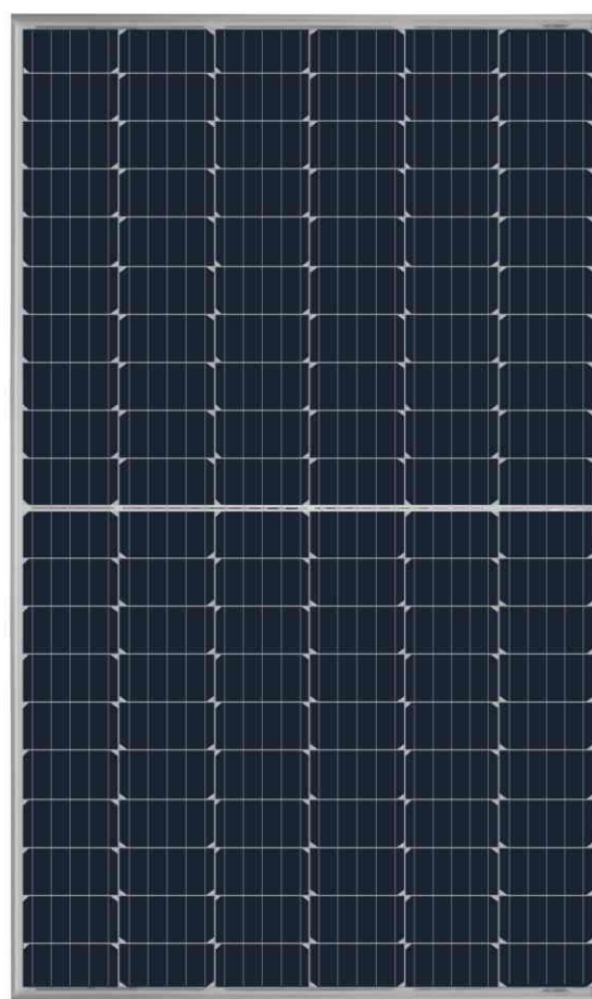
PV Module 25 Years Linear Performance Warranty